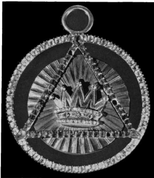
PAST FIRST PRINCIPAL'S COLLAR JEWEL set with brilliants, white on the circle, red on the triangle, and the colours of the Three Principals' robes on the base of the crown.