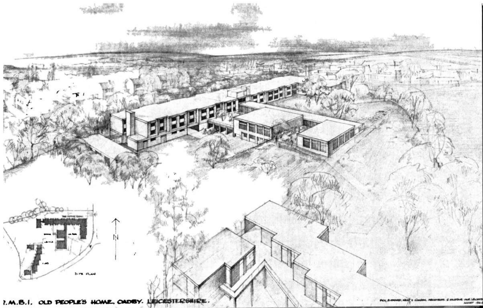
Y.M.B.I. OLD PEOPLE'S HOME, OADBY, LEICESTERSHIRE.

PLN, BY ERNEST, ALAN & GORDON, ARCHITECTS, 6 MARSHALL LANE, LEICESTER AUGUST 1964