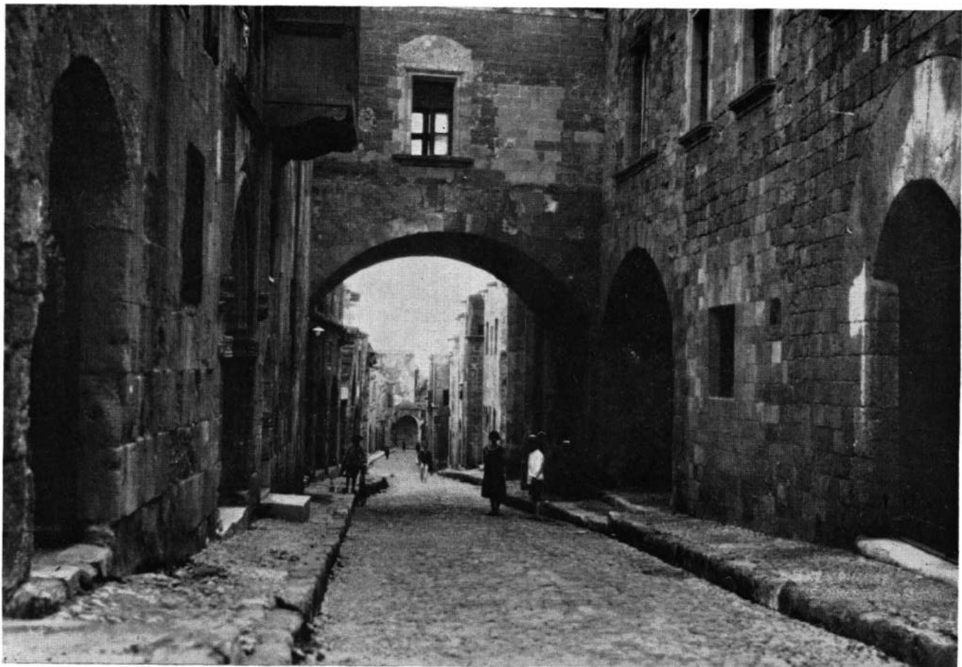
The Street of The Knights, Rhodes