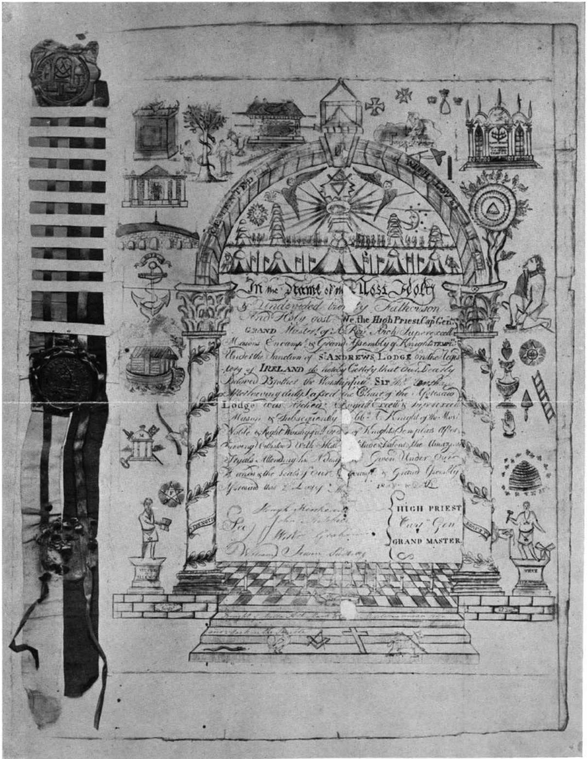
IRISH KNIGHT TEMPLAR CERTIFICATE.