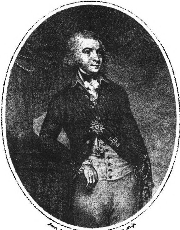
From an Original Picture..... Lenz sculp.